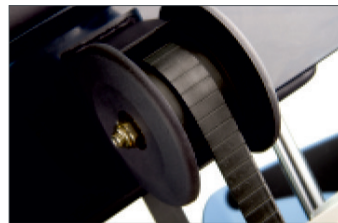
Universal belt driven design