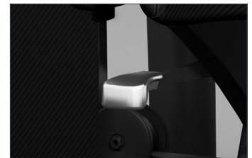
Aluminium touch points